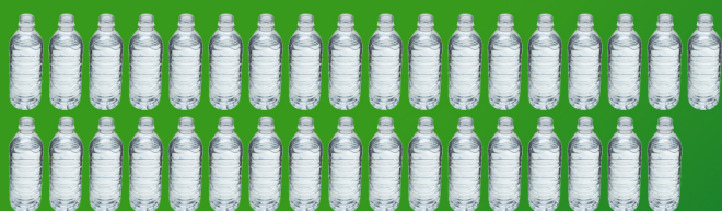
35 Water Bottles (16.9 oz.)

Americo has proven itself as a leader in “green” manufacturing and a true pioneer in Jan/San markets worldwide. 100% of the polyester fiber Americo uses in manufacturing floor pads, hand pads, and utility pads comes from recycled PET plastic, with a minimum 80% post consumer waste. Primary sources of these materials are recycled soda and water bottles.